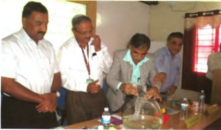
Organized by FRIC, Hebbal, Bengaluru sponsored by Directorate of Extension, KVAFSU, Bidar on 13<sup>th</sup> Oct. 2014

Brainstorming session on 'Fisheries Extension to Boost Fish Production-The way forward'