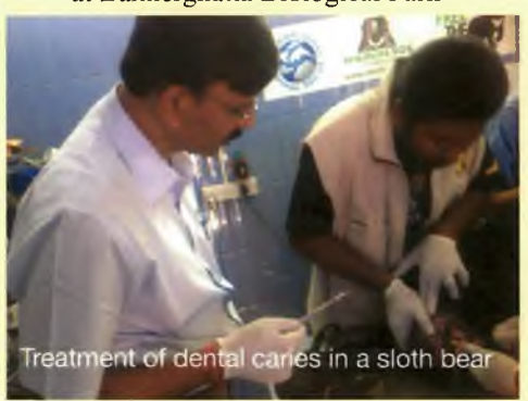
Treatment of Dental caries in sloth bear at wildlife SOS bear safari at Bannerghatta