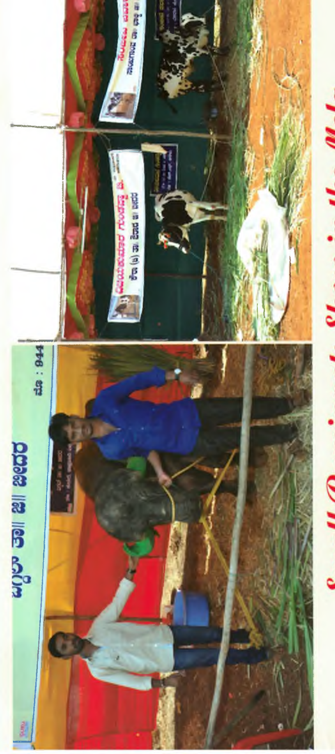
Small Ruminants Show in the Mela