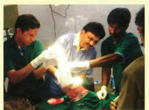
Amputation of injured forelimb in a leapard at Bannerghatta Biological Park