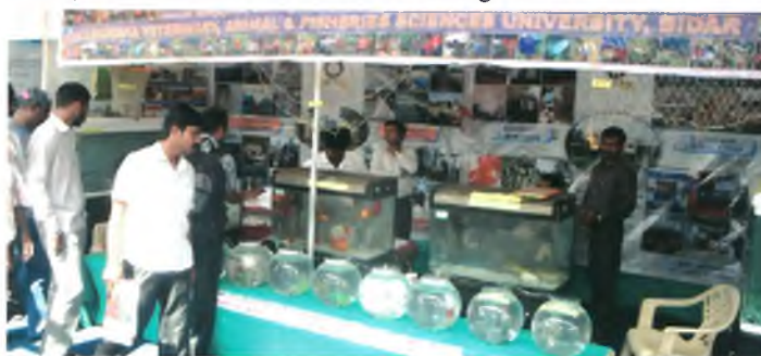
FRIC, Hessarghatta and FRIC, Hebbal put up an impressive fisheries stall at Krish Mela-2014 organized by UAS, GKVK, Bengaluru