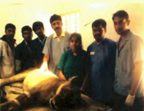
Surgical team after successful uterus remova in a Lioness at Bannerghatta biological park