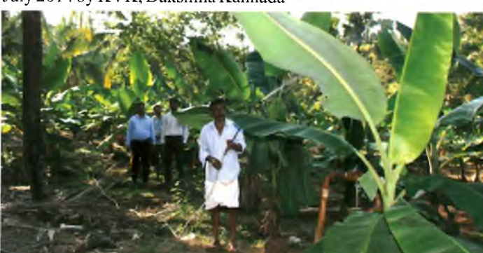
Front Line Demonstration on Banana Special Sprayin demonstration at Kaau village, Puttur by KVK, Dakshina Kannada