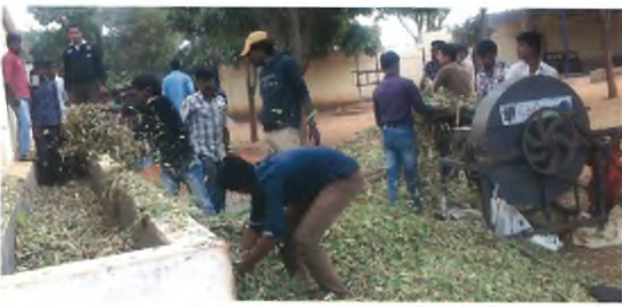
Demonstration of Silage making to Animal Husbandry Diploma Students