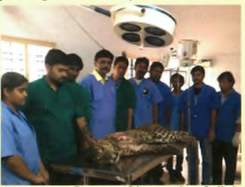
Surgery team after successful amputation of a limb in Leopard at Bannerghatta Park