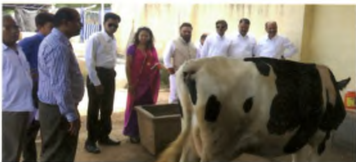
Visit of Hon'able Board Members to the Animal Husbandry Polytechnic, LRIC, Konehalli