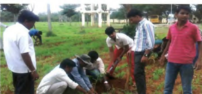
Planting of conventionl fodder plants by students at Animal Husbandry Polytechnic, LRIC, Konehalli Tiptur