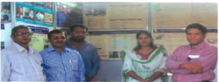
IAH&VB, Hebbal, Bengaluru put up a stall at Krishi Mela-2014 at U.A.S, GKVK, Bengaluru from 19-21 Nov. 2014