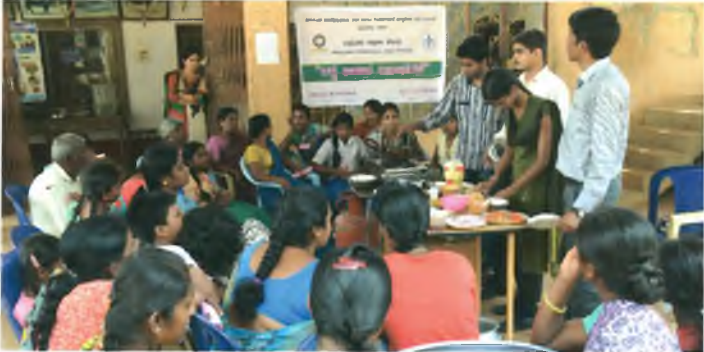
World Food Day and "Demonstration of Value added food products from fish, chicken meat and eggs" was organized at Yeliyur Village by EEC, Veterinary College, Bengaluru on 10th July 2014