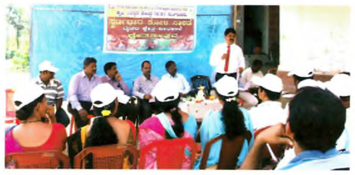
Field day of Farmers Field School on Popularization of Swarnadhara poultry birds at Agraar, Bantwala by KVK, Dakshina Kannada