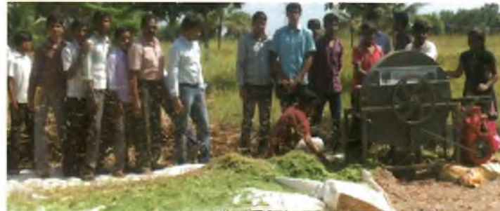
Demonstration of Fodder cutting by using Chaff cutter to the Animal Husbandry Polytechnic students LRIC(A), Konehalli