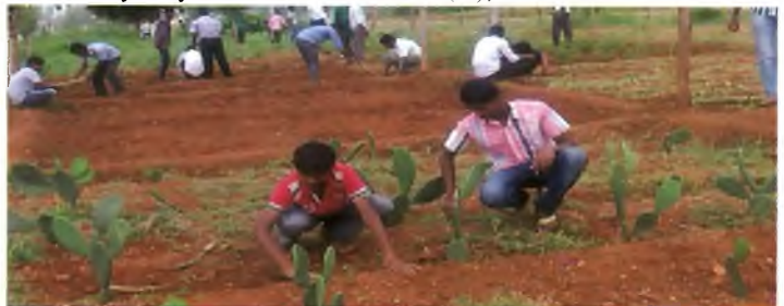
Preparation of Fodder plots by Animal Husbandry Polytechnic Students, Konehalli, Tiptur