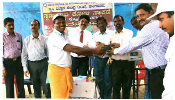
Distribution of "Swarnadhara" birds to farmers during Field day of Farmers Field School on Popularization of Swarnadhara poultry birds at Agraar, Bantwala by KVK, Dakshina Kannada