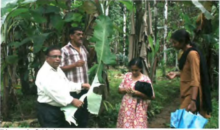
Diagnostic field visit was made in view of outbreak of banana leaf roller pest at Panja village of Sullia Taluk by KVK, Dakshina Kannada