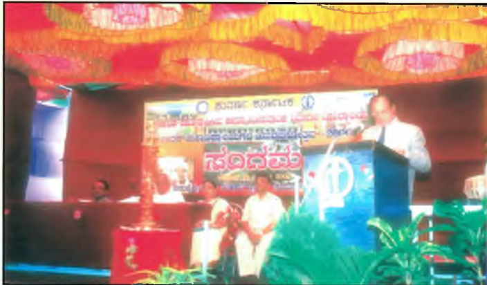
Inaugural Function of Sangam Youth Festival at Bidar

College, Bidar secured Overall Runnerís Up trophy. The university team represented in All India Inter State agricultural Universities Youth Festival "AGRIUNIFEST-2006" held at Raipur, Chhattisgarh. KVAFSU team has given dazzling performance and bagged one gold (one act play), one silver (folk dance) and one bronze (debate) medal.