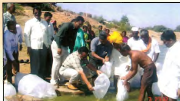
Fish Seedling release programme was held in the Over all champions Veterinary College, Bilore presence of Registrar, Director of Extension and Prof. of Aquaculture, on 8.12.2006 at Dammur Village of Bagalkot Dist.