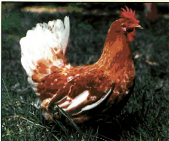
Swarnadhara : Variety of Poultry