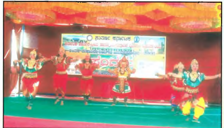
Students performing 'Yakshagana'