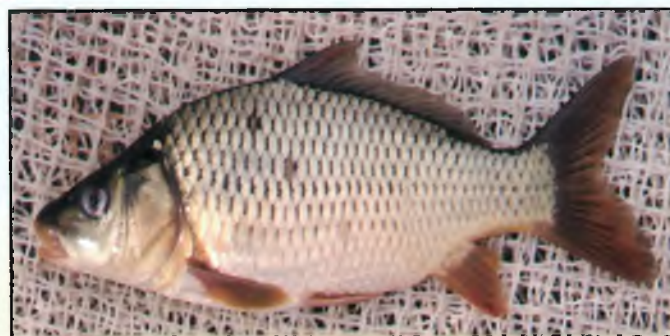
Amur Variety of Common Carp