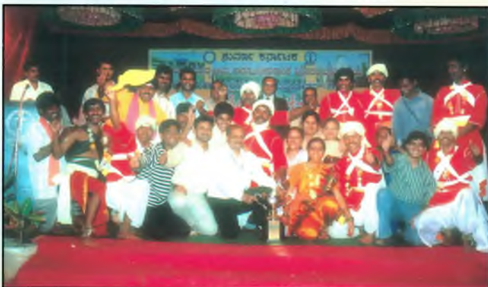
Over all champions Veterinary College, Bangalore