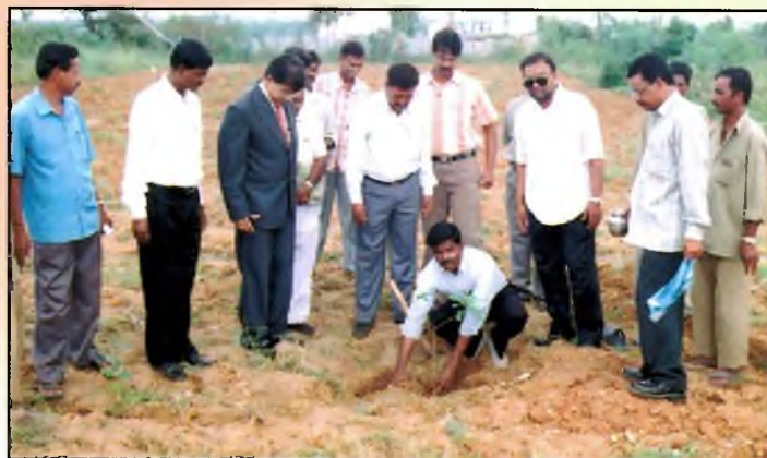
Mango Plantation Programme was organized on 9.11.2006 at Research Station, Nagamangala