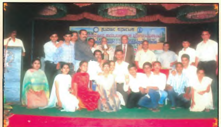
Runner's Up Trophy by Vety. College, Bidar