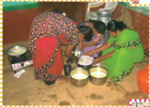
Dairy Science College, Bangalore organised One Day Training & Demonostration on Milk products preparation for the women on 26th Aug. 2005