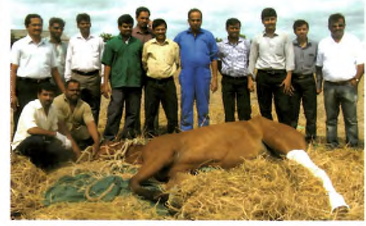
Surgical Management Of Transected Superficial Digital Flexor Tendon (sdft) Of Left Hind Limb In A Thoroughbred VCS Shivamogga