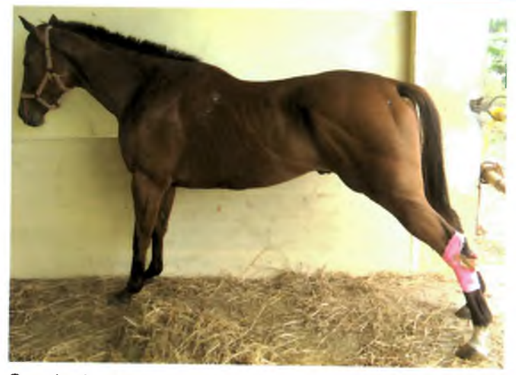
Surgical Management of Transected Superficial Digital Flexor Tendon (sdft) Of Left Hind Limb In A Thoroughbred