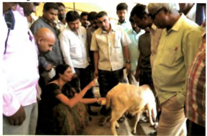
Training on "Piggery Rearing and Management"

Training on "Sheep and Goat Rearing Management" Five training programs for farmers on "Sheep and Goat Rearing and Management" were conducted from January 2015 to June 2015 at Technology Transfer Centre of Veterinary College, Hebbal, Bengaluru. Farmers from various districts of Karnataka were benefited from these trainings.