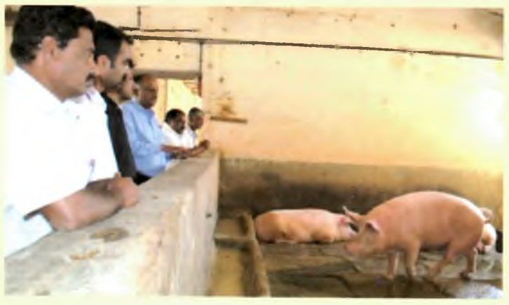
Training on "Project formulation for financial assistance in livestock farming"

The Extension Education Center, Veterinary College, Bengaluru organized training programme on 'Piggery Rearing and Management' during February 2015 for the benefit of the farmers.