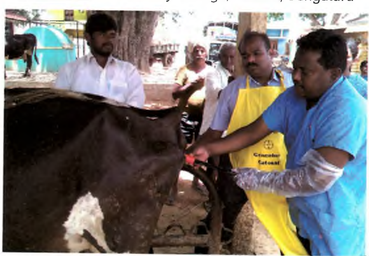
Assisted reproductive technique in a cow