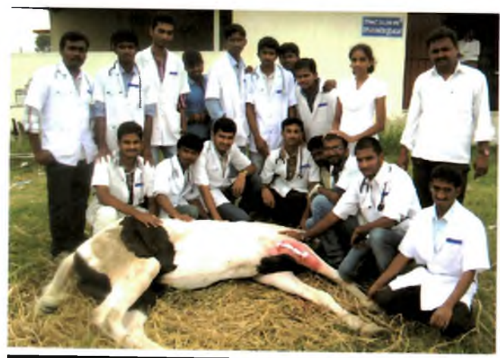
Hands on training - Rectal Examination in a Cow for Students, Dept. of VGO, Veterinary College, Bengaluru