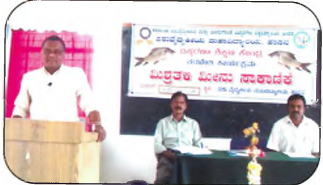
Training Programme "Polyculture of Fish in Ponds and Tanks" on 20 & 21st March, 2012 at Veterinary College, Hassan